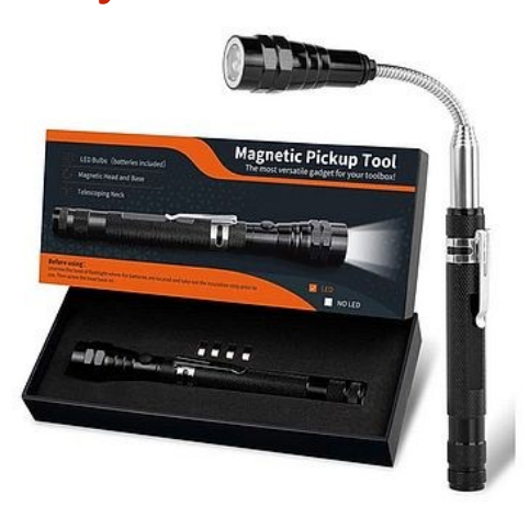
LED Magnet Tool $13.95