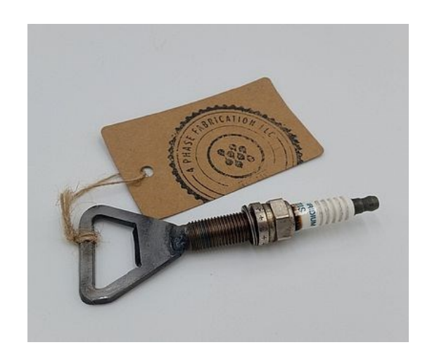
Spark Plug Bottle Opener $15.95