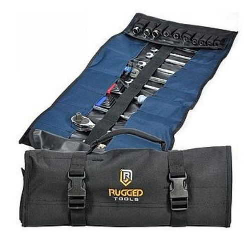
32 Pocket Tool Roll Organizer $17.99