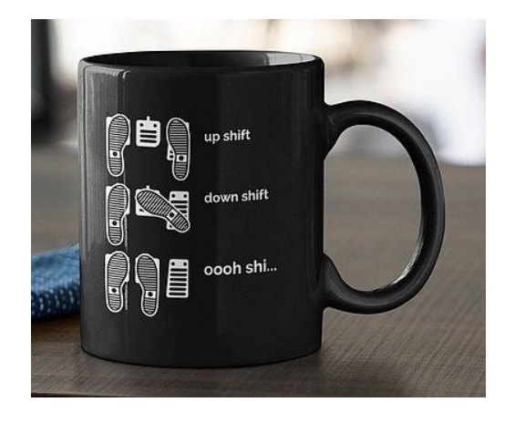
Funny Mug $21.19