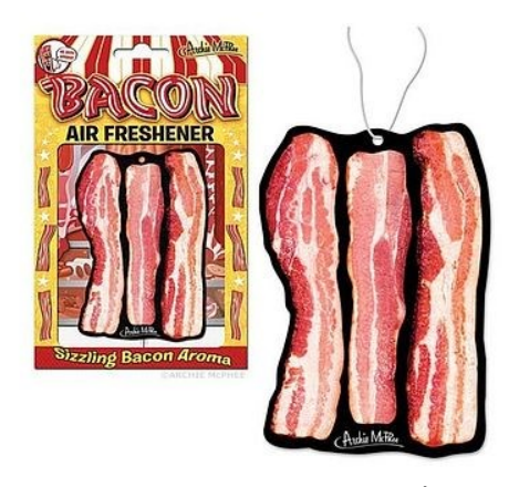
Bacon Air Freshener $5.99