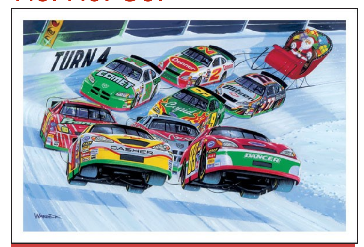
You know Dasher and Dancer...