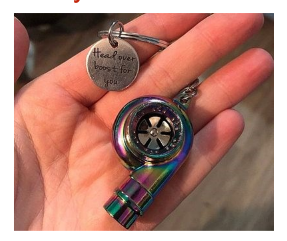
Turbo Keychain $20.00