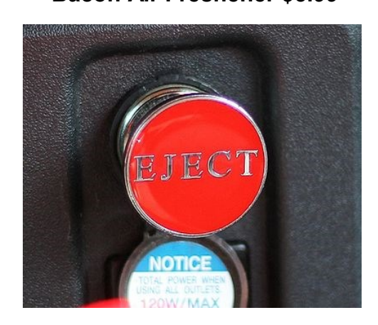
Eject Button $10.99