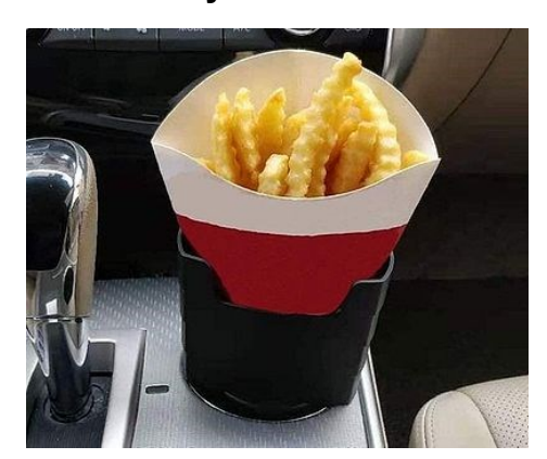
French Fry Cupholder $11.49