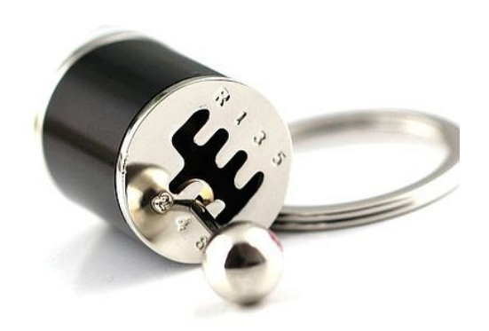
Gearshift Keyring $7.99