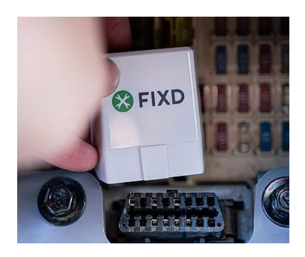
Bluetooth Scan Tool $29.99