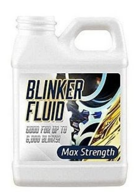
Blinker Fluid $9.95