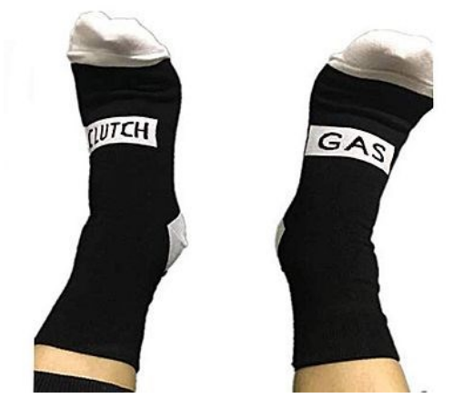
Funny Socks $6.99